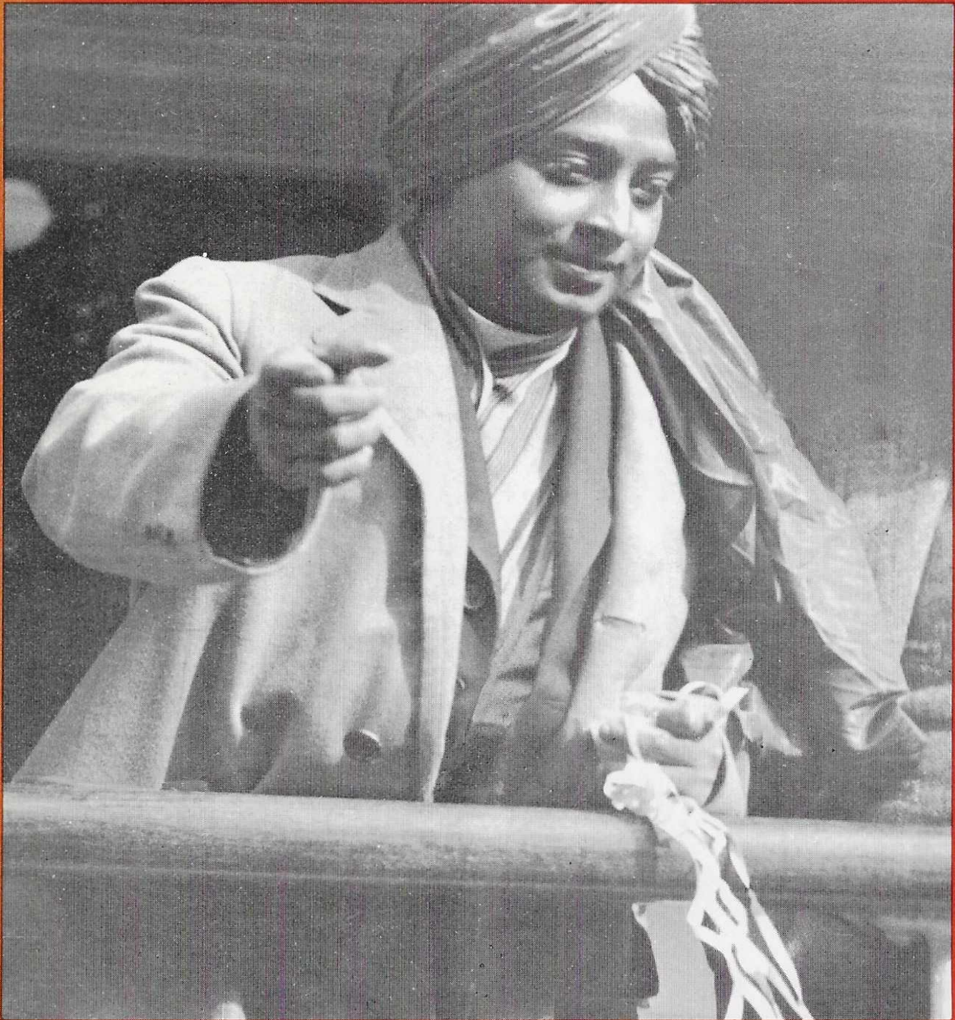
Paramahansa Yogananda on ship en route to Alaska September 1925